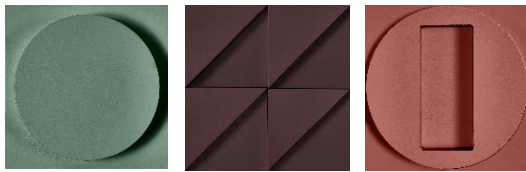
Hineteiwaiwa Papatūānuku Hinetitama